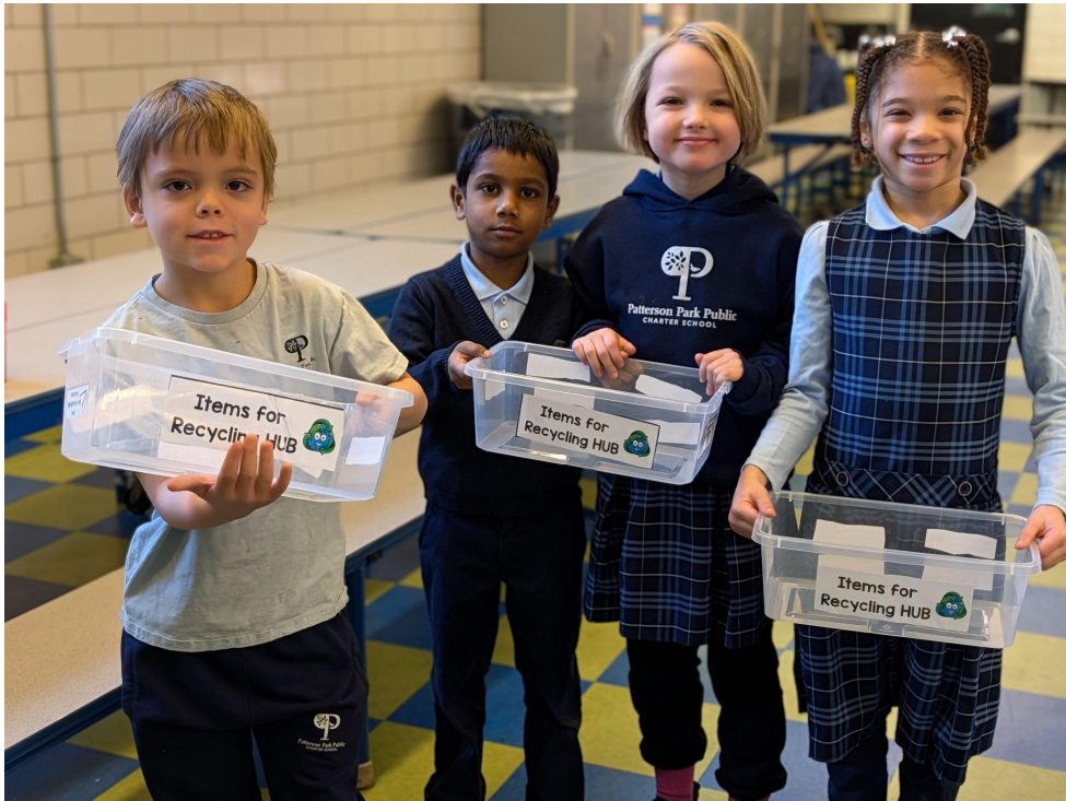
First-grade Green Team members educate their class on the new Recycling Hub.